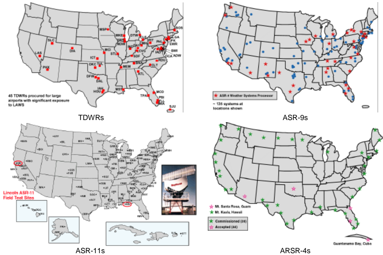
Figure 1. Locations of FAA surveillance radars.